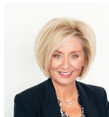
President and CEO